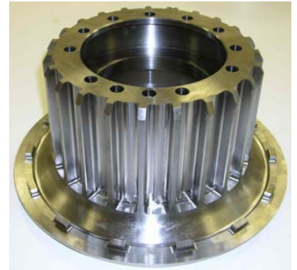
Aircraft brake component about 0.5m across made from a titanium alloy composite.

The NCN's MMC working group consists of key representatives from the UK's main MMC materials suppliers, end-users and universities. The group produced a technology roadmap in March 2006, which is on the NCN web site and available to logged-in, registered NCN members: view document .